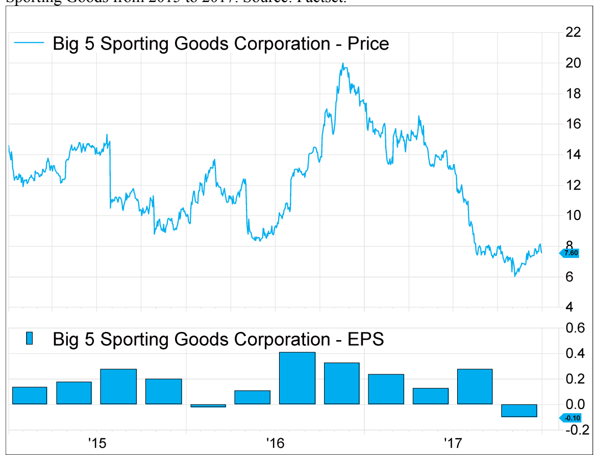
Figure 2. Graph of Stock Price and Quarterly Earnings Per Share (EPS) for Big Five Sporting Goods from 2015 to 2017.

Figure 3 illustrates how quantitative investors bought shares in Big Five as performance temporarily improved, and then sold the shares as the secular decline set back in. This figure plots the ownership trends for the top holders of Big Five as of 3/31/2017, which was the point in time that quantitative investors dominated ownership. The top 25 holders as of 3/31/2017 had increased their ownership from just 40% at 9/30/2016 to over 70% by 12/31/2016 and over 80% by 3/31/2017. Figure 3 also shows that short sellers supplied most of these shares. But as sales slowed and stock price momentum petered out in the second half of 2017, these same investors started selling the stock, reducing their ownership to about 50% by the end of 2017.